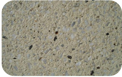
BLIZARD 1 IVORY