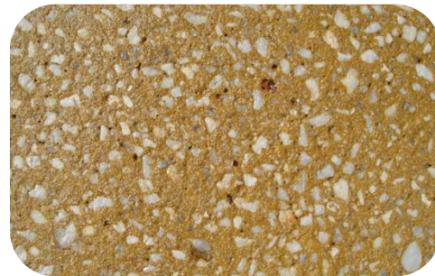
DUNE SAND BEACH