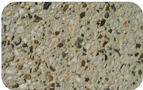
OCEANIC 3 IVORY