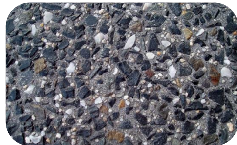
PALERMO 1 BLACK