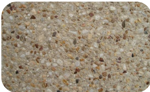
CHEYENNE 4 IVORY