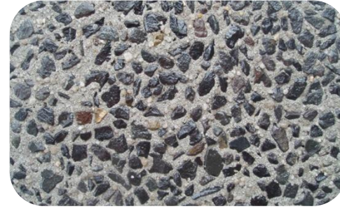
BROAD PEAK ASH