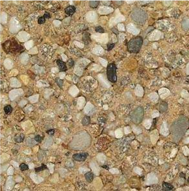
STONE CHARACTERISTICS OUTSIDE PHOTO RANGE MAY VARY

There are likely to be variations in consistency of colours and textures, appearance and quality in the finished product of the hardened concrete, as the raw ingredients are natural and subject to variations beyond our control. Whilst every effort has been made to match the colours in the preparation of this document, reproductive processes will alter the actual appearance in the concrete products to varying degrees.